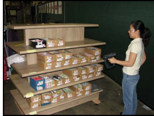
Photograph 7: Static Fixture—Mobile Reader Testing With Shoes

For the shoe test, items were tagged and placed on the shelf fixture. An associate would use a mobile device to scan the items on the shelf by walking around the fixture while pointing the device at the items. The mobile readers were used in a sweeping motion around the fixture making sure that the reader was used in both horizontal and vertical orientations to account for tag orientation. This process allowed the associate to capture the available reads. See Photograph 7.