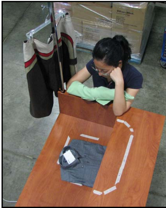
Photograph 12: Point of Sale

While the reader was actively scanning for tags, tagged items were hung on the extendable bar built in as an extension of the desk and designed for exactly this purpose. This scenario might