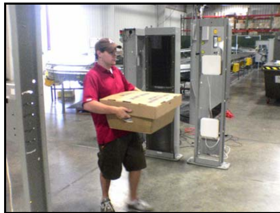
Photograph 16: Testing With Hand Carried Box