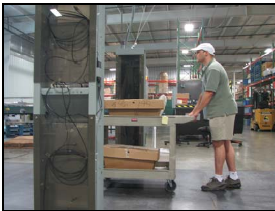
Photograph 15: Testing With Boxes on Handcart

For the box test, the portal was configured in compliance with EPCglobal Dynamic Door Portal Test Specification and EPCglobal Dynamic Conveyor Portal Test Specification standards. The first box test consisted of two boxes on one handcart per level which was moved through the portal (see Photograph 15). The second box test consisted of a single box of items hand carried through the portal by an associate (see Photograph 16). The third box test consisted of boxes being transported at three different speeds (600, 400, and 200 feet per minute) on the conveyor (see Photograph 17). The fourth box test consisted of boxes on a steel cart (see Photograph 18).