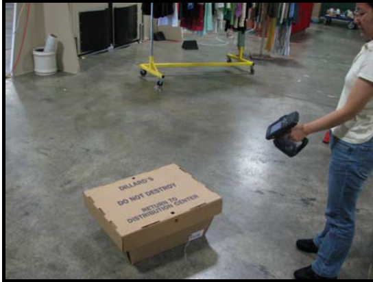
Photograph 4: Static Fixture—Mobile Reader Testing with Boxes

For the box test, items were tagged and placed in the transport box. An associate would use a mobile device to scan the items in the box by walking around the box while pointing the device at the box and move his or her arm in a sweeping motion within the vicinity of the items to capture the available reads. See Photographs 4 and 5.