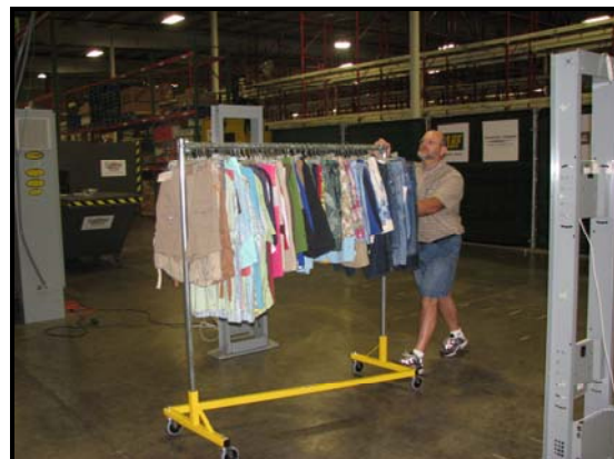
Photograph 14: Clothes Placement on Z-Bar