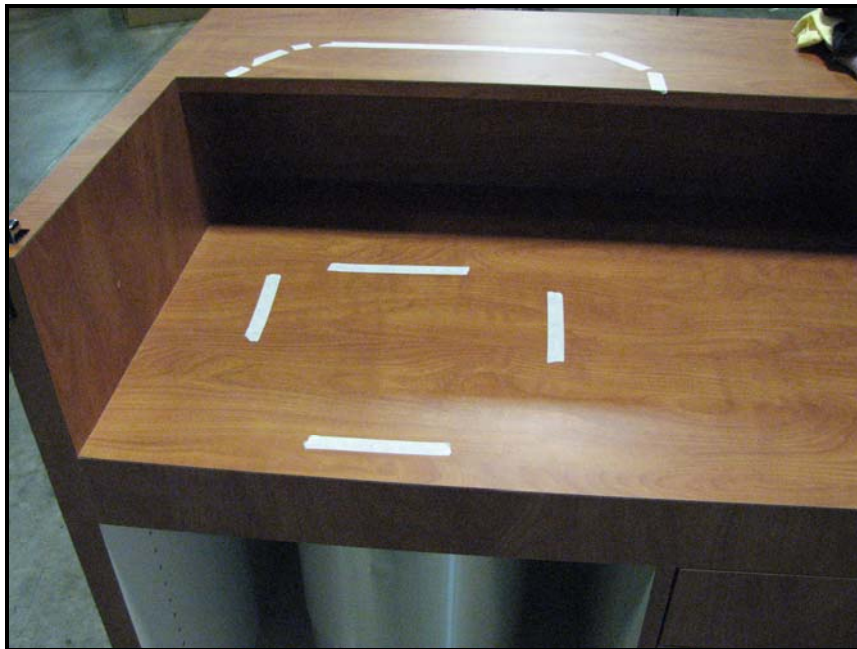
Photograph 10: Demarcated Read Area on Sales Desk Surface

The reader's power setting was reduced from maximum power, 30 dBm, to the lowest setting capable of being entered through the user interface, 15 dBm. This reduced the read field to the area shown in Photograph 10. The masking tape describes the boundary of the read field. The height of the field from the top of the counter is approximately 1.5 feet in free space. The read field still expands slightly outward as it moves away from the top of the cylinder, but the circumference to which it expands is greatly reduced, which is desired.