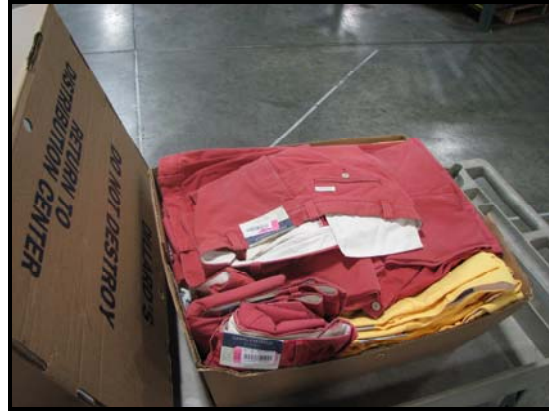
Photograph 5: Clothes Placement in Box