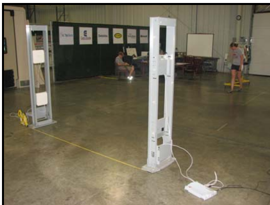
Photograph 13: Portal for Testing with Z-Bar

For the z-bar test, the portal was configured in compliance with EPCglobal Dynamic Door Portal Test Specification standards (set at 10 feet apart). See Photographs 13 and 14. For testing, an associate would push the z-bar through the portal 30 times at a constant speed.