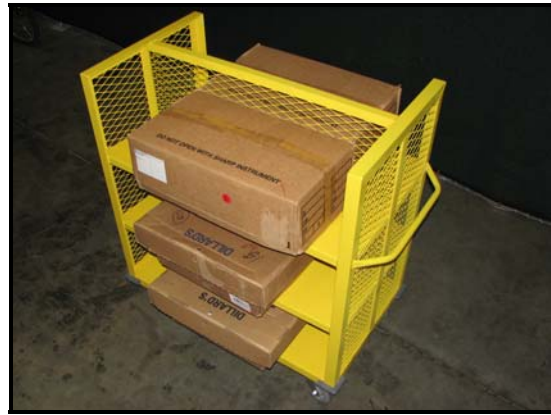
Photograph 18: Boxes on Steel Cart