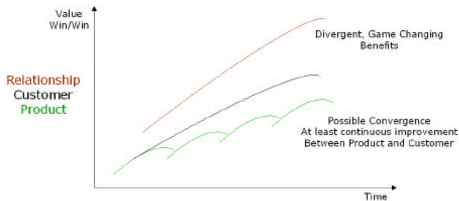
Figure 6 Benefits are greater and more speedily achieved

Figure 6 demonstrates that the life cycle focus as described in this paper has been more of an evolutionary approach in how organizations view the customer relationship. The benefits for product life cycle are shown to be continuous and overlapping. The focus of customer life cycle suggests that additional benefits might be achieved. This is arguable, as simple aggregation would suggest no difference over the long term. However we can assume that some level of good will would be achieved and therefore some "natural" increase in revenue for the seller in question is achieved. The benefits attributed to the relationship life cycle are clearly greater and more speedily achieved when the buyer and seller align their strategies and work together. This is both intuitive and logical. It has also been demonstrated in the early work associated with CPFR when real examples of win/win have been realized. It remains to be seen which software providers "get it" sufficiently in order to capitalize on the relationship life cycle.